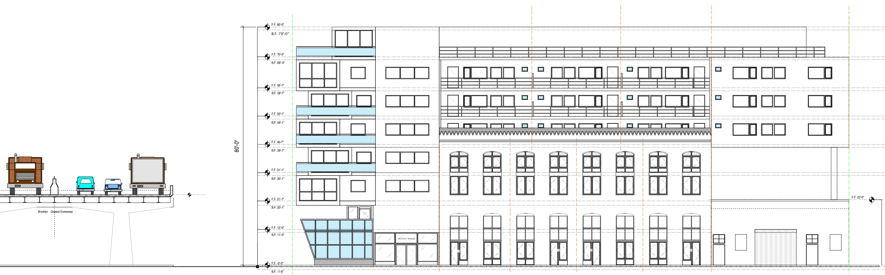
N. 7th Street Elevation

These Drawings & The Work They Cover Are Instruments Of Service For Kushner Studios Architecture + Design, P.C. & Remain Their Property. Neither This Drawing, Nor Any Other Drawings, Plans, Specifications, Reports, Proposals, Reports, or Documents, Shall Be Reproduced, Copied, Distributed, or Used in Any Manner Without the Written Permission of Kushner Studios Architecture + Design, P.C. In Accordance With the Terms of the Professional Services Agreement Between Kushner Studios Architecture + Design, P.C. and the Client. Any Use of These Drawings, Plans, Specifications, Reports, Proposals, Reports, or Documents Without the Written Permission of Kushner Studios Architecture + Design, P.C. May Result in Legal Action. Kushner Studios Architecture + Design, P.C. and the Client Agree to Indemnify and Hold Each Other Harmless From and Against All Claims, Damages, Losses, Expenses, Fees, and Costs, Including Reasonable Attorneys' Fees, That May Be Incurred by Either Party as a Result of the Use of These Drawings, Plans, Specifications, Reports, Proposals, Reports, or Documents Without the Written Permission of Kushner Studios Architecture + Design, P.C.